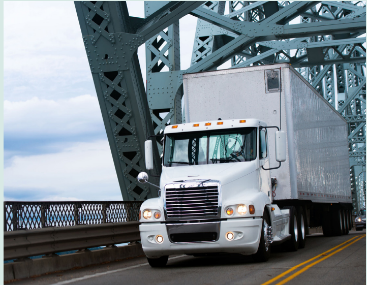
Truck owners rely on IPD engine parts

Check with your IPD regional sales manager or customer service representative for our latest offerings or visit IPDNet at store.ipdparts.com